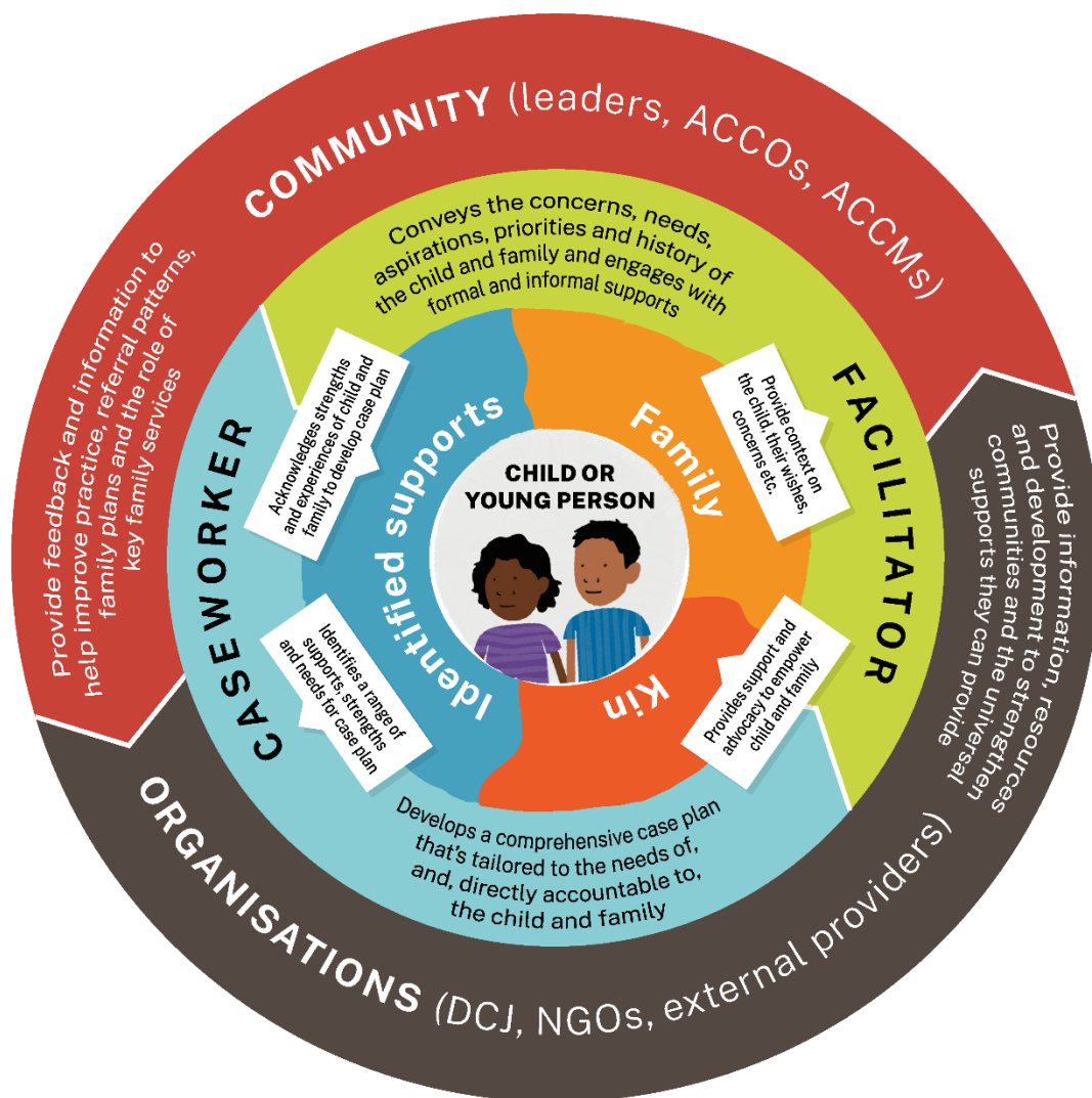
Diagram: Key participants and relationships in Aboriginal family-led decision making

This diagram demonstrates how family and kin should be integral in the decision making process about the care, safety and welling of their children. Unlike previous practice it recognises how a community facilitator can be involved providing support and advocacy, and how the community can provide valuable information and support about culture and history. (ACCMs are Aboriginal community controlled mechanisms. ACCOs are Aboriginal community controlled organisations).